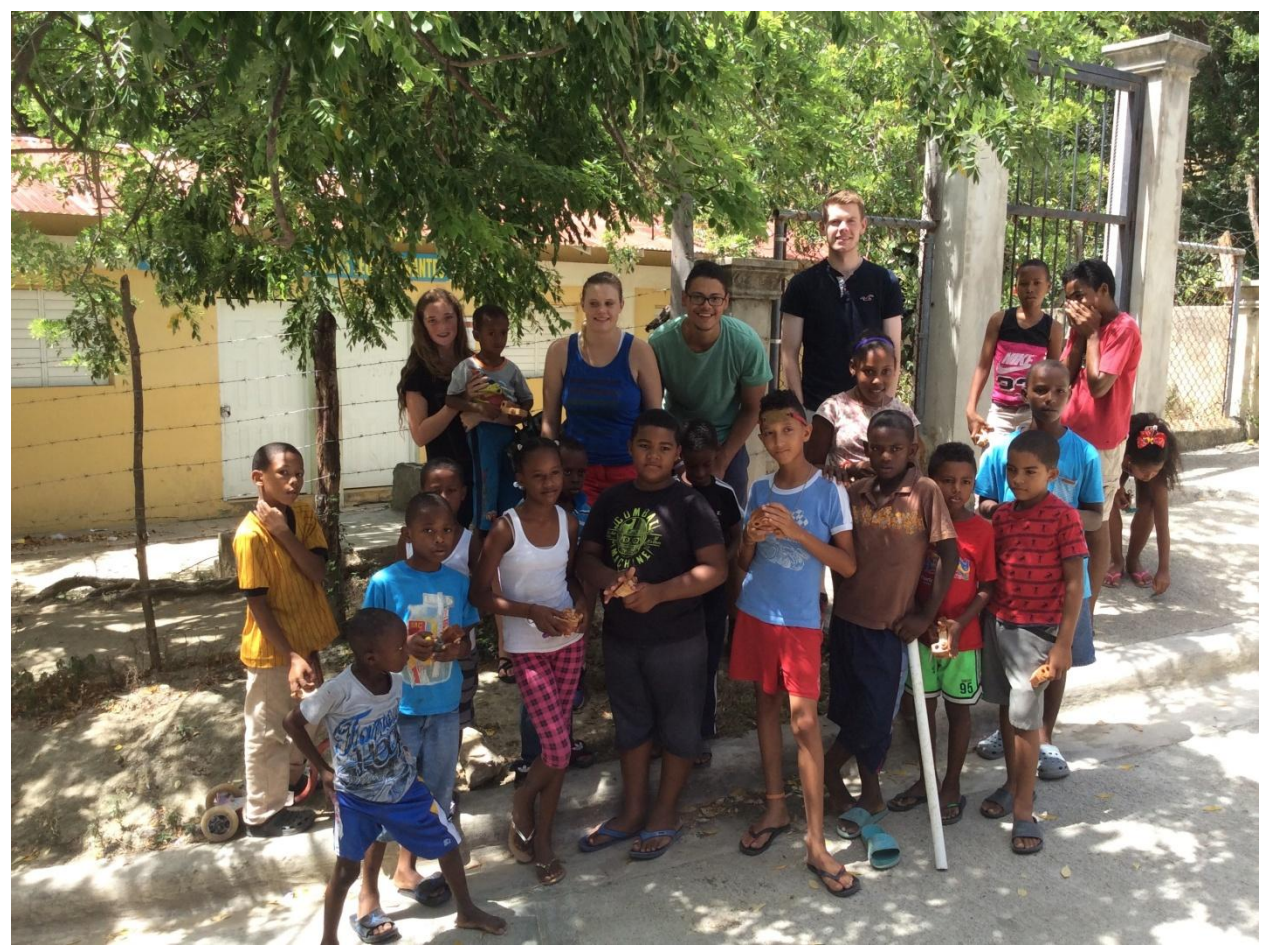
Local kids that followed us up to the school and got to receive toys.

This is a community we visited with the Dominican Starfish foundation. They have helped build houses in this area and also helped rebuild their school that was falling apart. We handed out toys to the kids in this community who all followed us up to the top of their hill where the school is located so we could pass out toys to them. My boyfriend who translated for me told me that one of the kids shouted and exclaimed "They got me a truck!" as he pushed his toy down the hill.