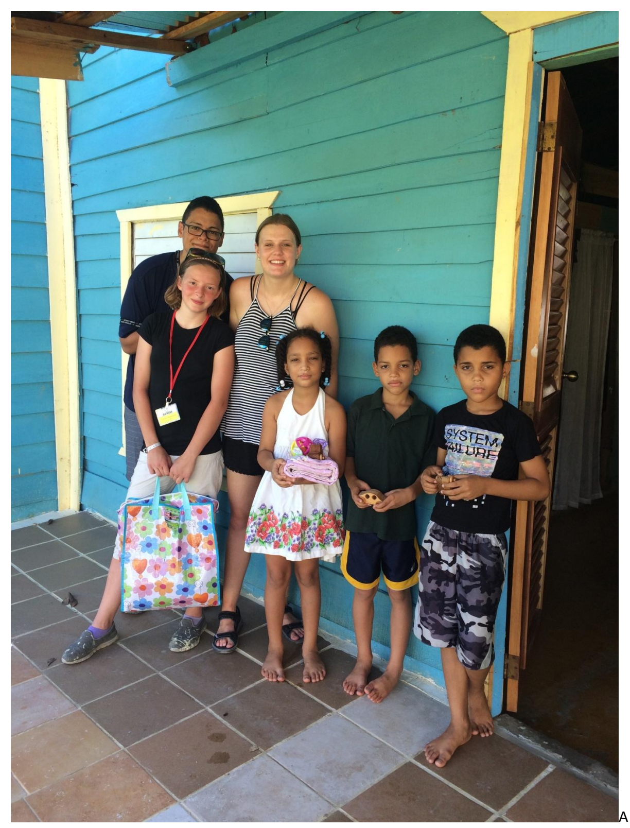
family we delivered a food pack to and gave their three children toys. Their mom made them change into nicer clothes because we wanted a picture with them.