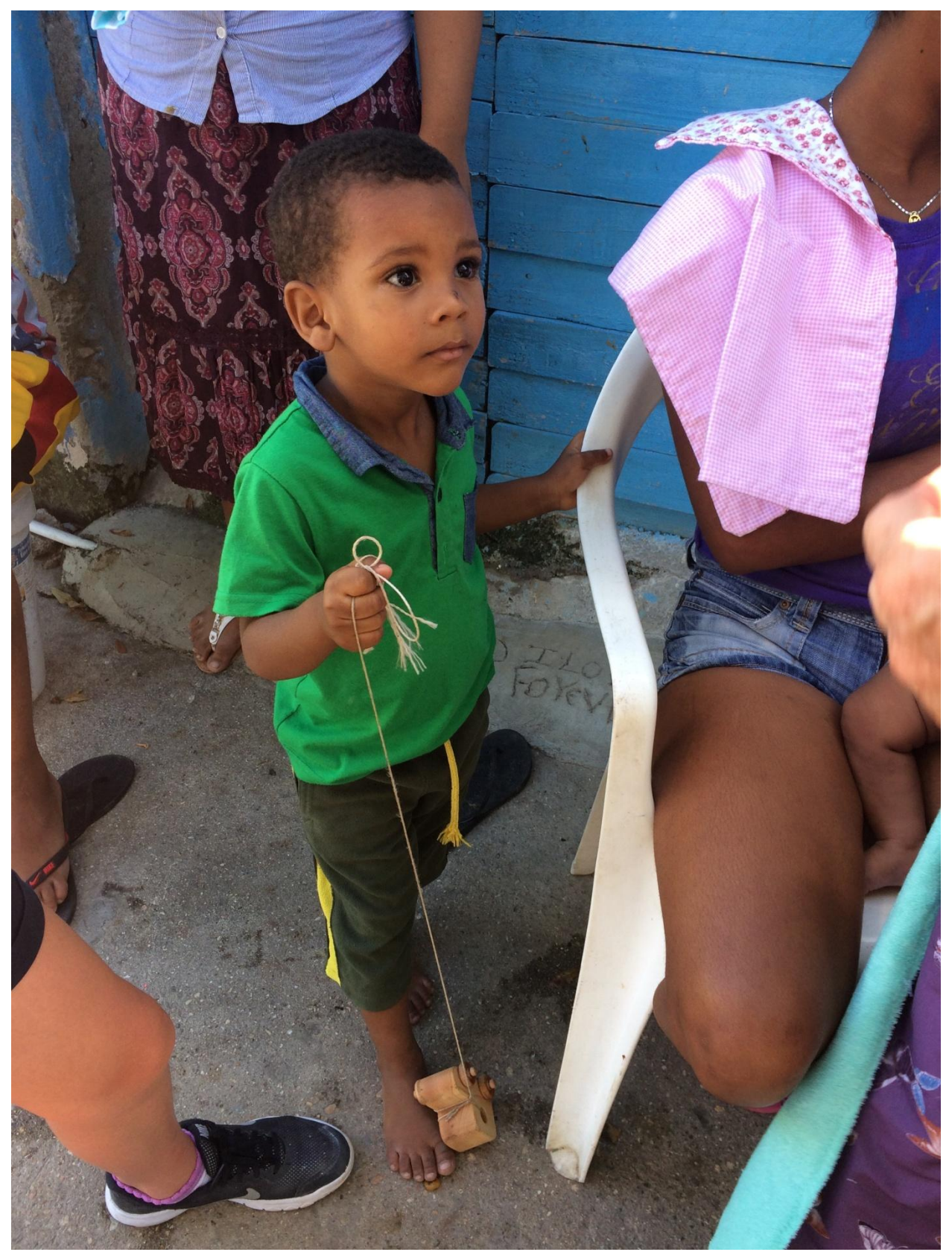
Little boys attached strings to their new cars and pulled them around with them!